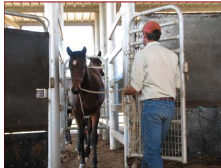
Alert x Bargain Hunter filly beginning to lead