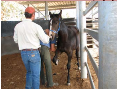
Alert x Peaceful Sky filly getting her feet trimmed