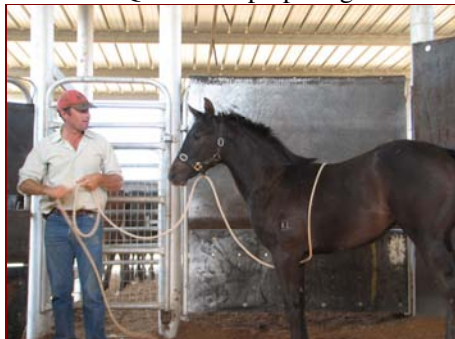
Alert x Belle Esteem filly in her first leading lesson