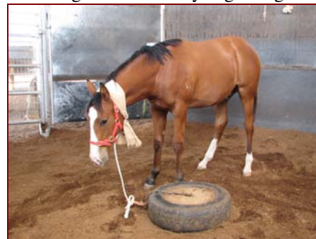
Alert x Bow Bells colt in his second tying-up lesson