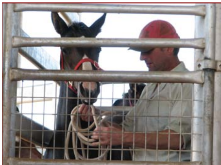
Alert x Grail Queen colt preparing for a lesson