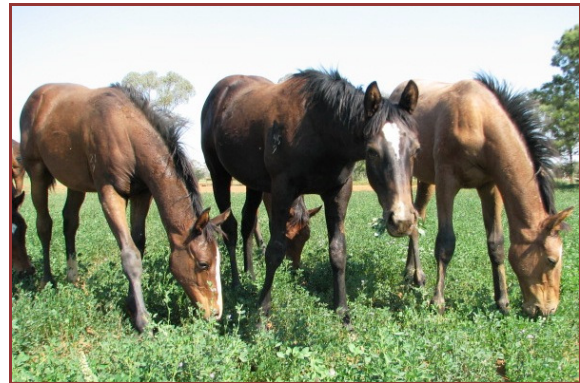
Weanling colts in their lush lucerne paddock