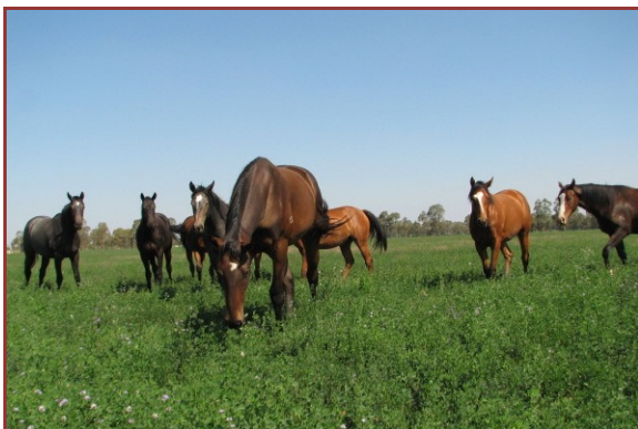
Yearling fillies in their lush lucerne paddock

Fabulous rains arrived early last month, absolutely drenching Kooringal and the Wagga area. Over 120mm fell in 24 hours, giving the soil as much moisture as it could take, which has set us up for some lovely pastures this year. The permanent lucerne paddocks are up to the horses knees, and the newly sown paddocks have begun to emerge which will ensure more than enough feed through winter and spring.