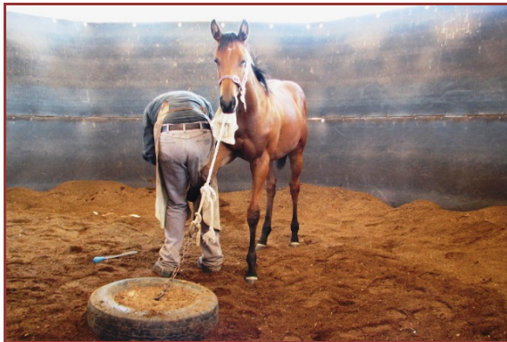
King Cugat x Cautious Lover weanling filly preparing for farrier work