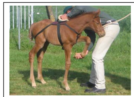
Octamistic / Bureaucracy filly